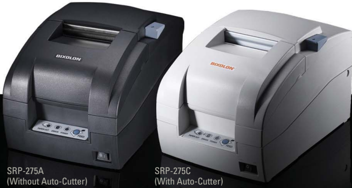
SRP-275A (Without Auto-Cutter)

The BIXOLON SRP-275 is an enhanced, more powerful successor to BIXOLON's best-selling SRP-270 Series of receipt printers. The BIXOLON SRP-275 receipt printer is compact, reliable and fast, and offers all of the easy-to-use features important to retail, restaurant, and hospitality environments.