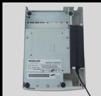
Built-in Power Supply

The 220V AD adapter is elegantly integrated into the compact printer housing. Consequently, messing around with cables is avoided which is ideal at space-limited POS terminals or highly frequented cash desks.