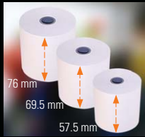
Variable Paper Width